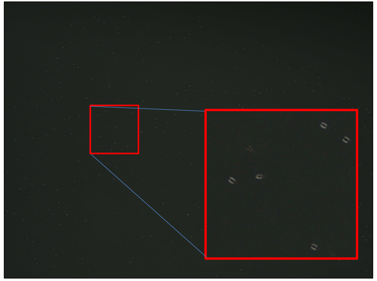
Figure 3. A single frame (e.g., parent image) from camera number two taken on 10 November 2021 captures a large flock of goldeneye. Zoomed in area shows individual targets more closely, which allows species level classification.